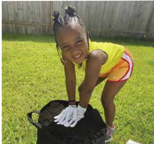
Grow Kits bring the lessons of the garden home.

In 2020, our traditional in-person classes transitioned online with opensource webinars, remote classes, virtual cooking demos, kids' activities, organic gardening videos, blogs, and recipe cards to make garden and nutrition education accessible to all.