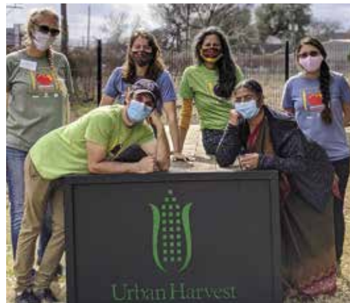
Our garden educators are at the forefront of Urban Harvest's work, teaching in and maintaining gardens across Houston.

Urban Harvest offers year-round, organic garden education and is the only organization in the region that offers Permaculture Certification, Starting a School or Community Garden, and professional development for teachers through The Edible Academy.